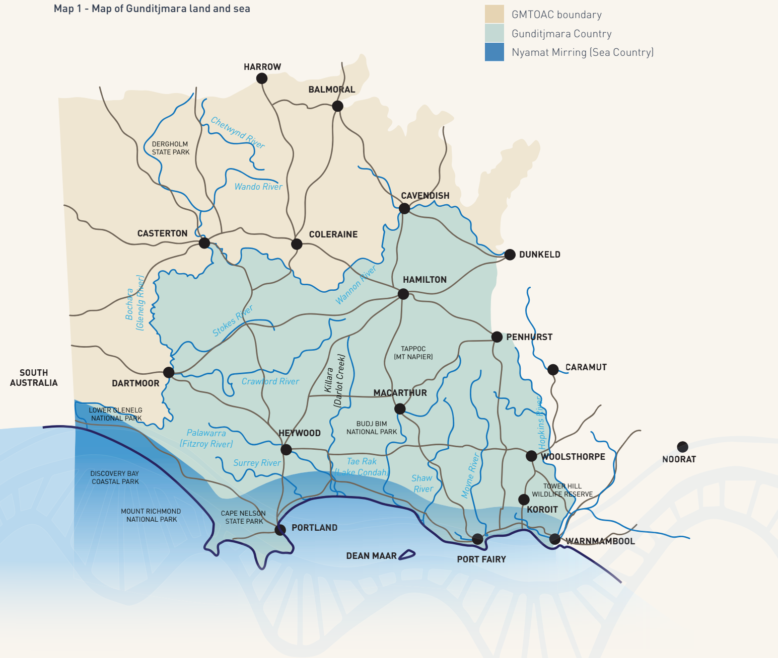
Map 1 - Map of Gunditjmara land and sea