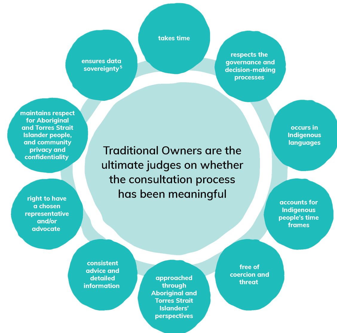
Figure 1 - Engaging with Traditional Owners - Free, Prior and Informed consent (AIATSIS), 2020