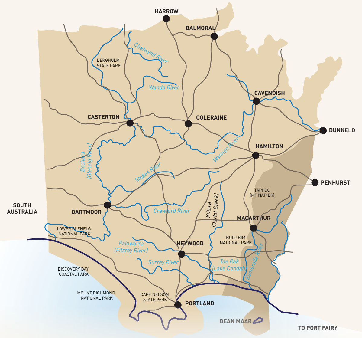
Map 2 - Map of GMTOAC RAP Area

Gunditj Mirring Traditional Owners Aboriginal Corporation Registered Aboriginal Party area